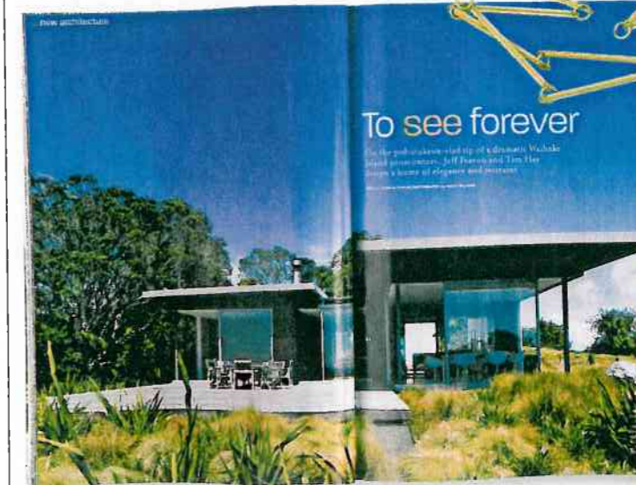
ABOVE Fearon Hay's Waiheke Island bach perches above two bays and is blessed with pohutukawa, silence and views.

Something simple and minimal like Fearon Hay's wooden bach on Waiheke Island from our Dec/Jan 2007 issue.